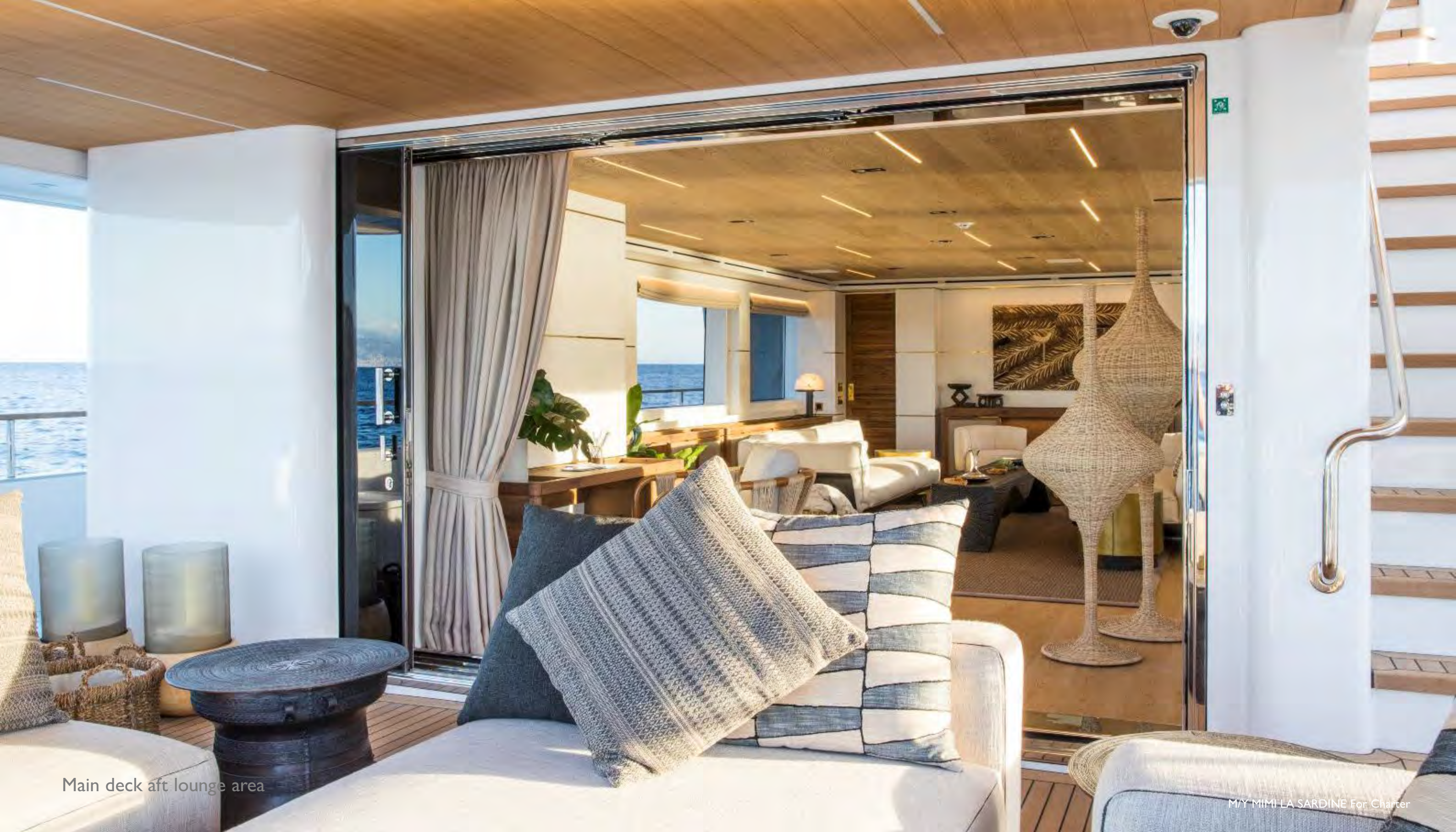
Main deck aft lounge area