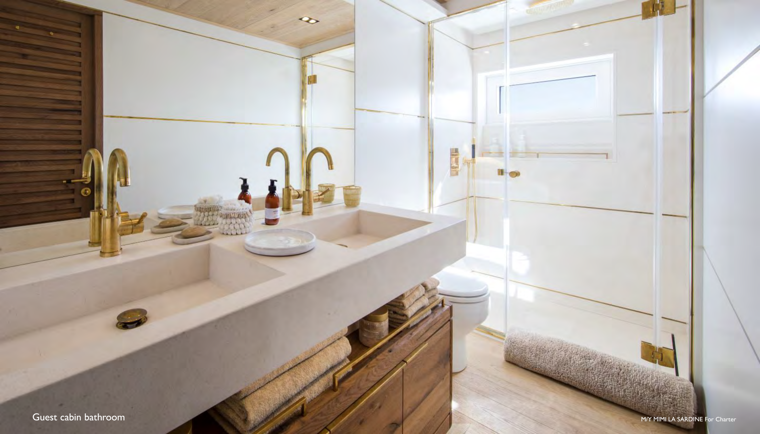
Guest cabin bathroom