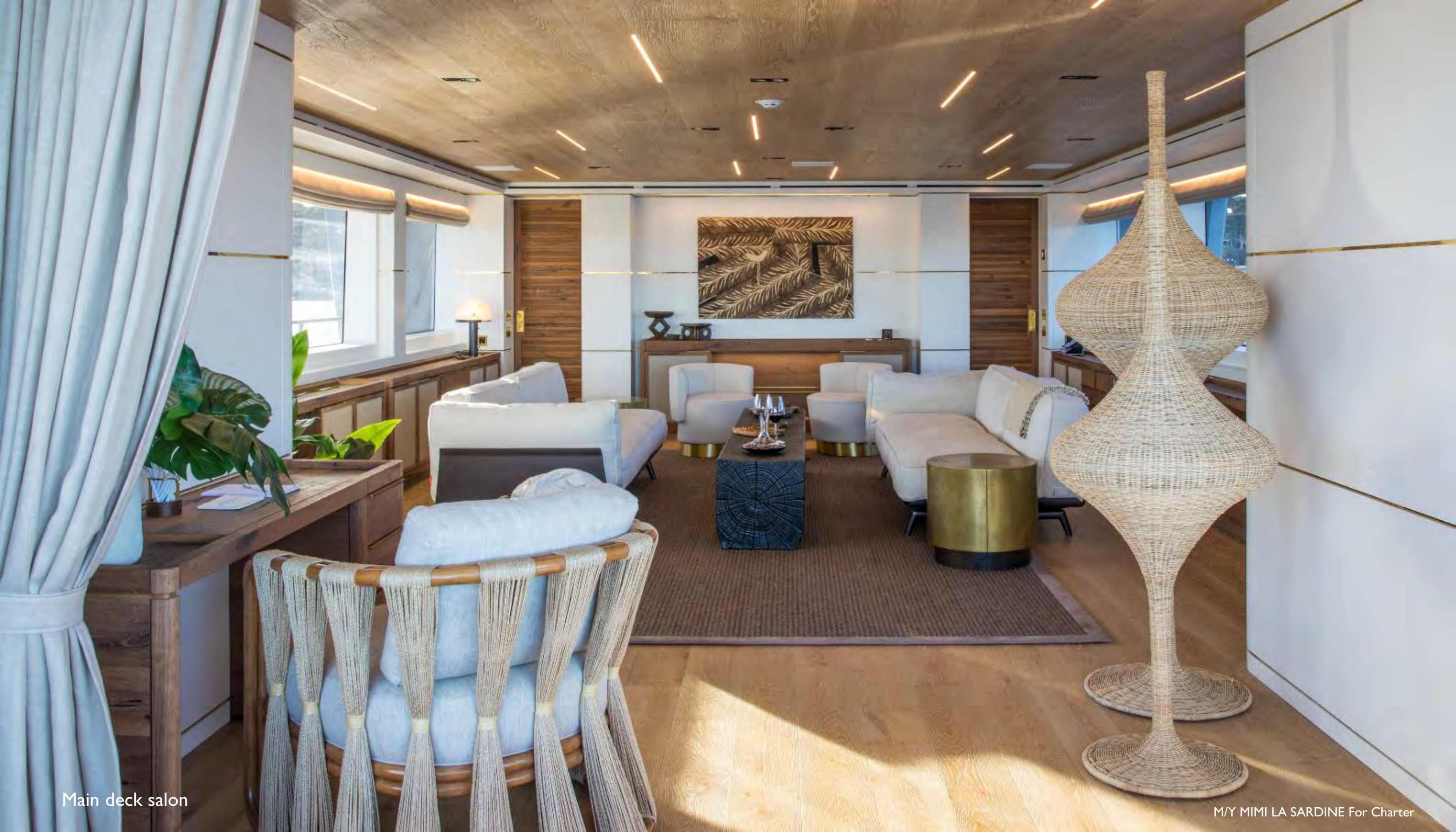
Main deck salon