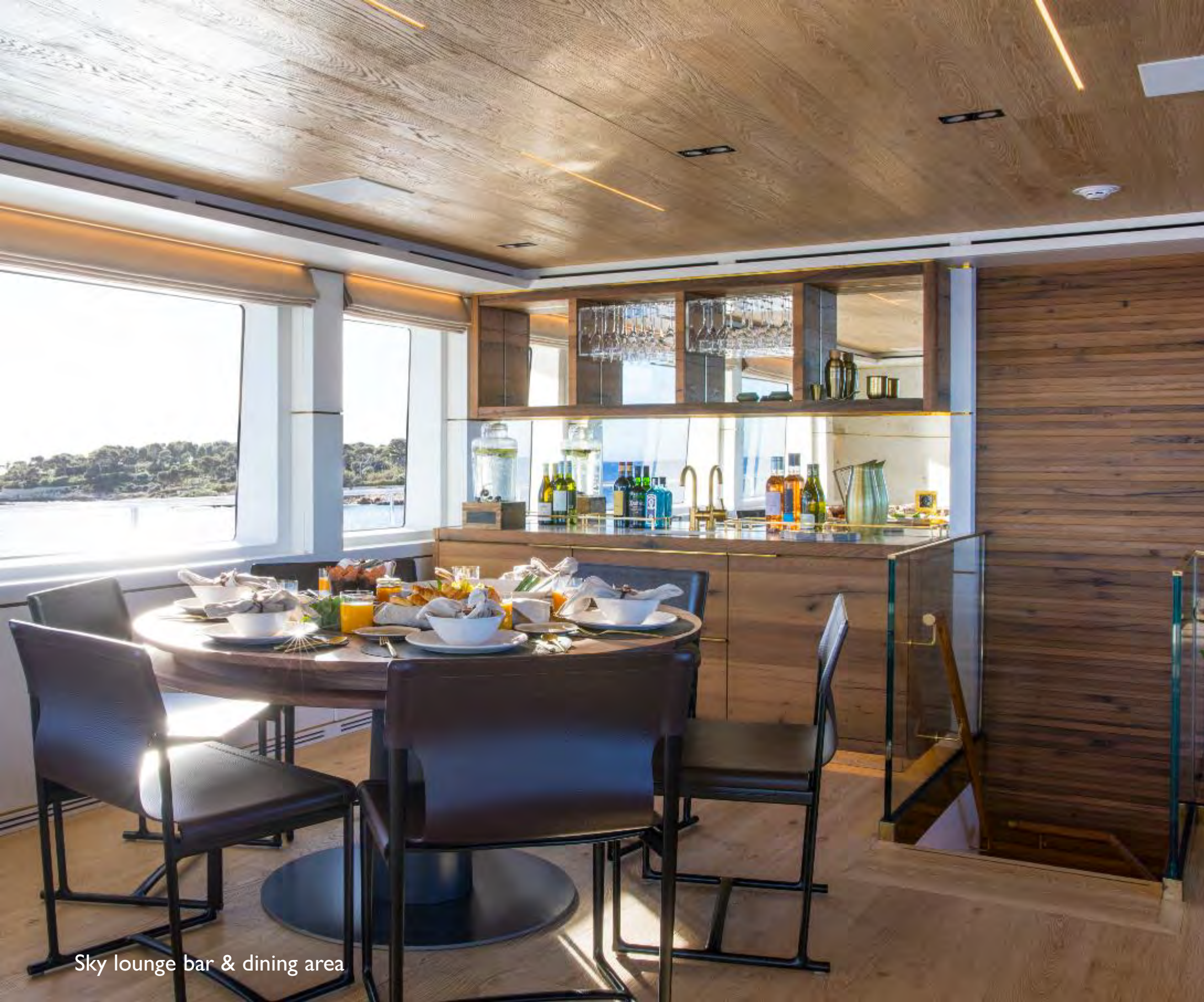
Sky lounge bar & dining area