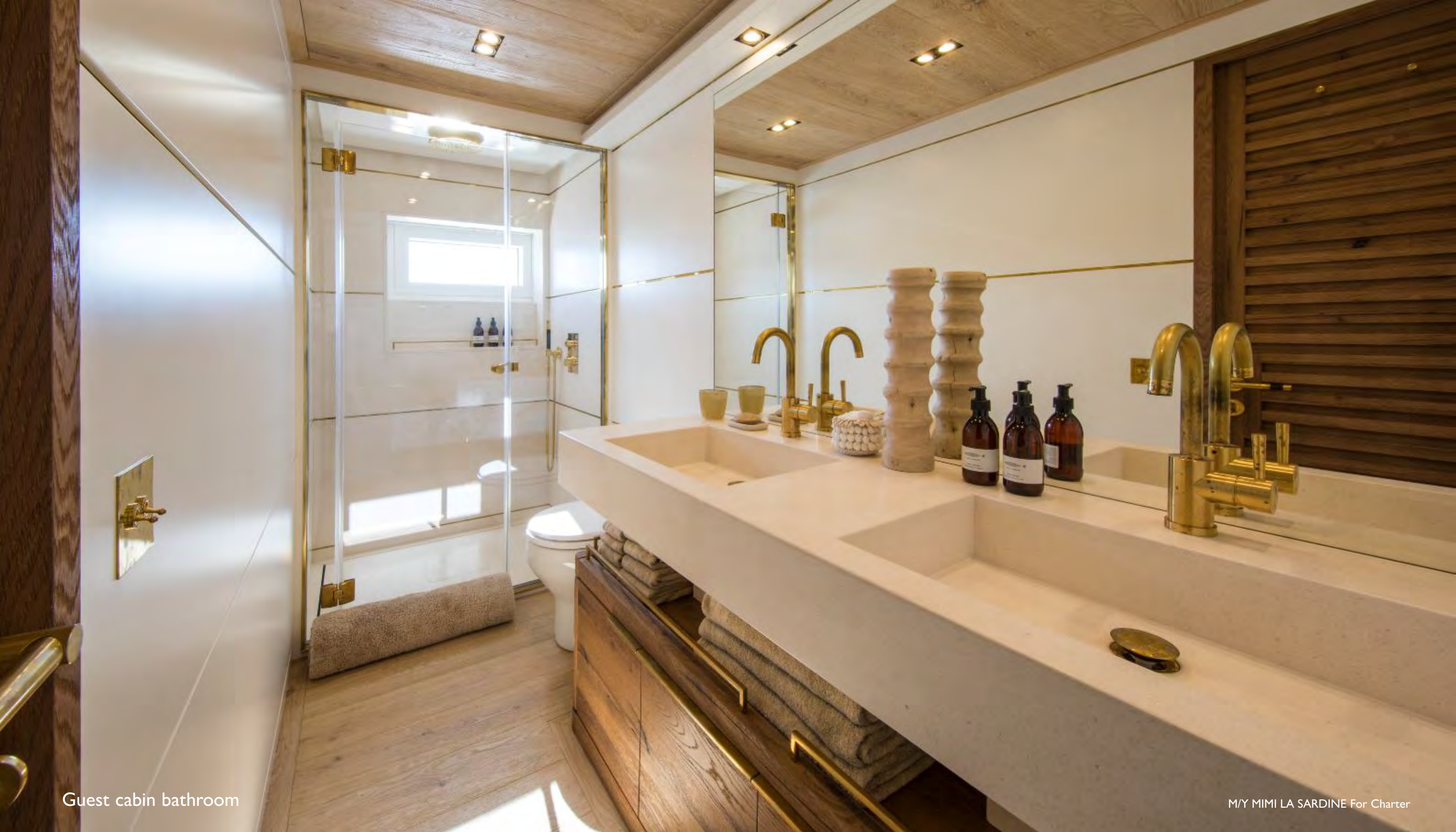
Guest cabin bathroom