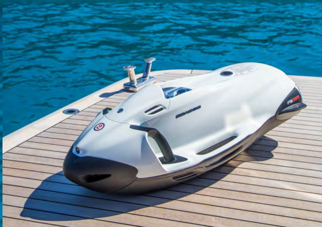
Tenders & toys