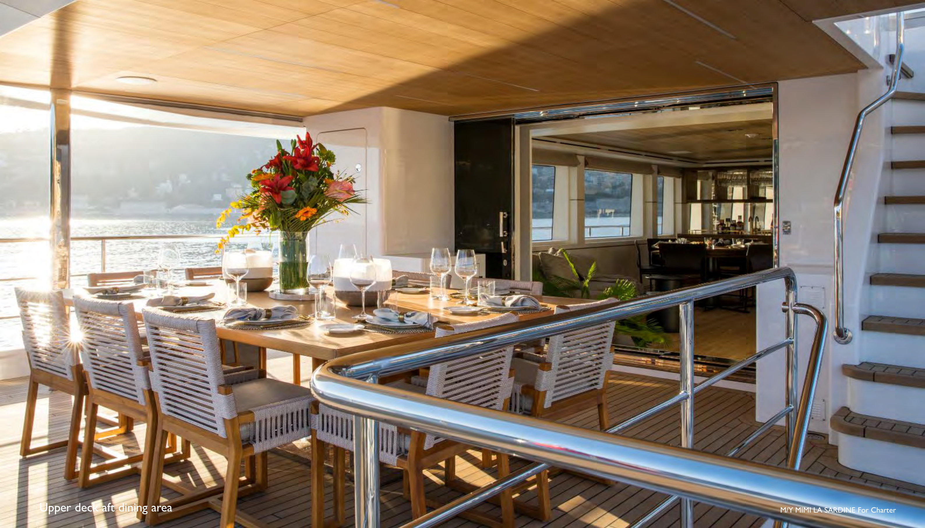
Upper deck aft dining area