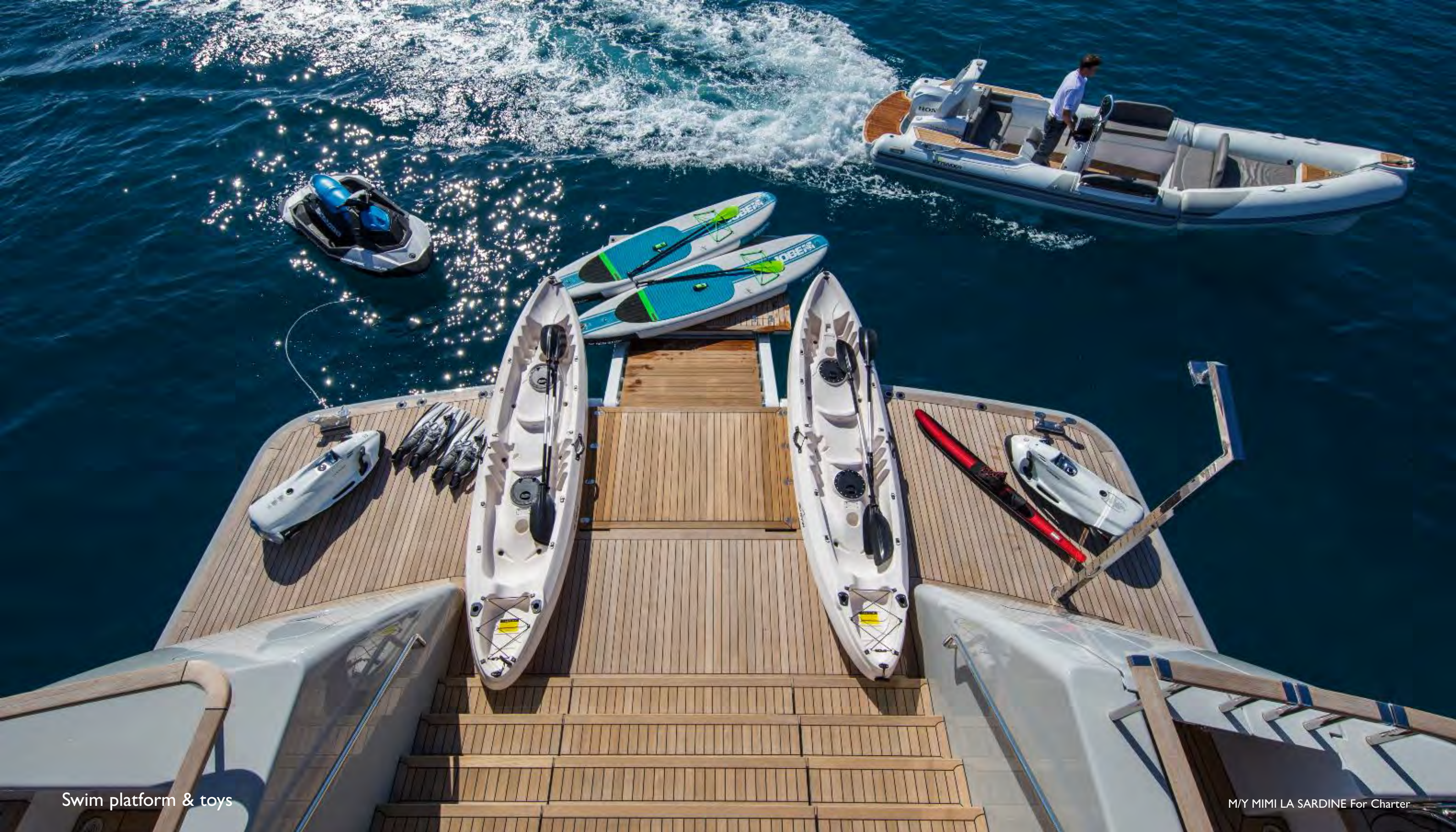
Swim platform & toys