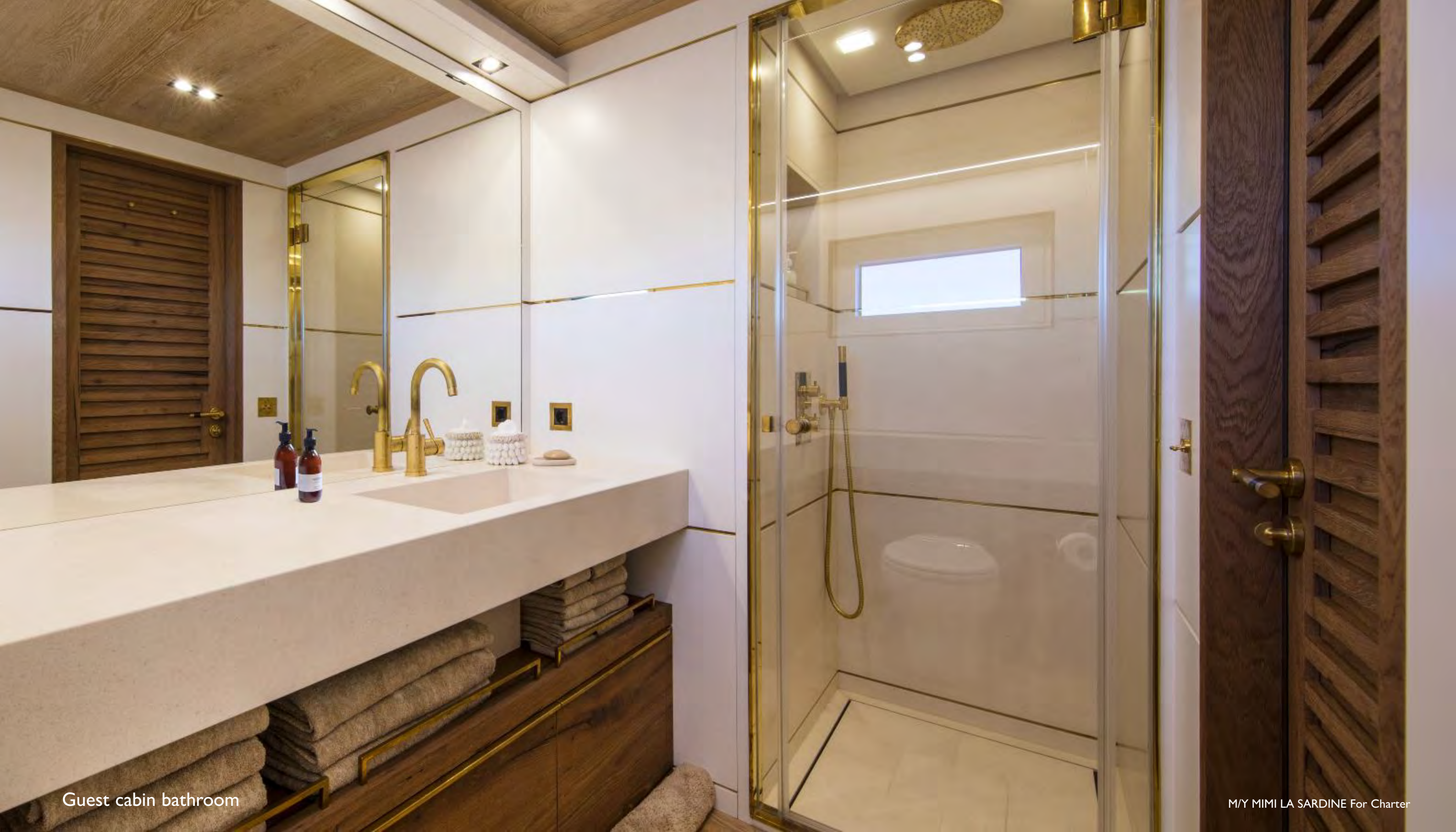
Guest cabin bathroom