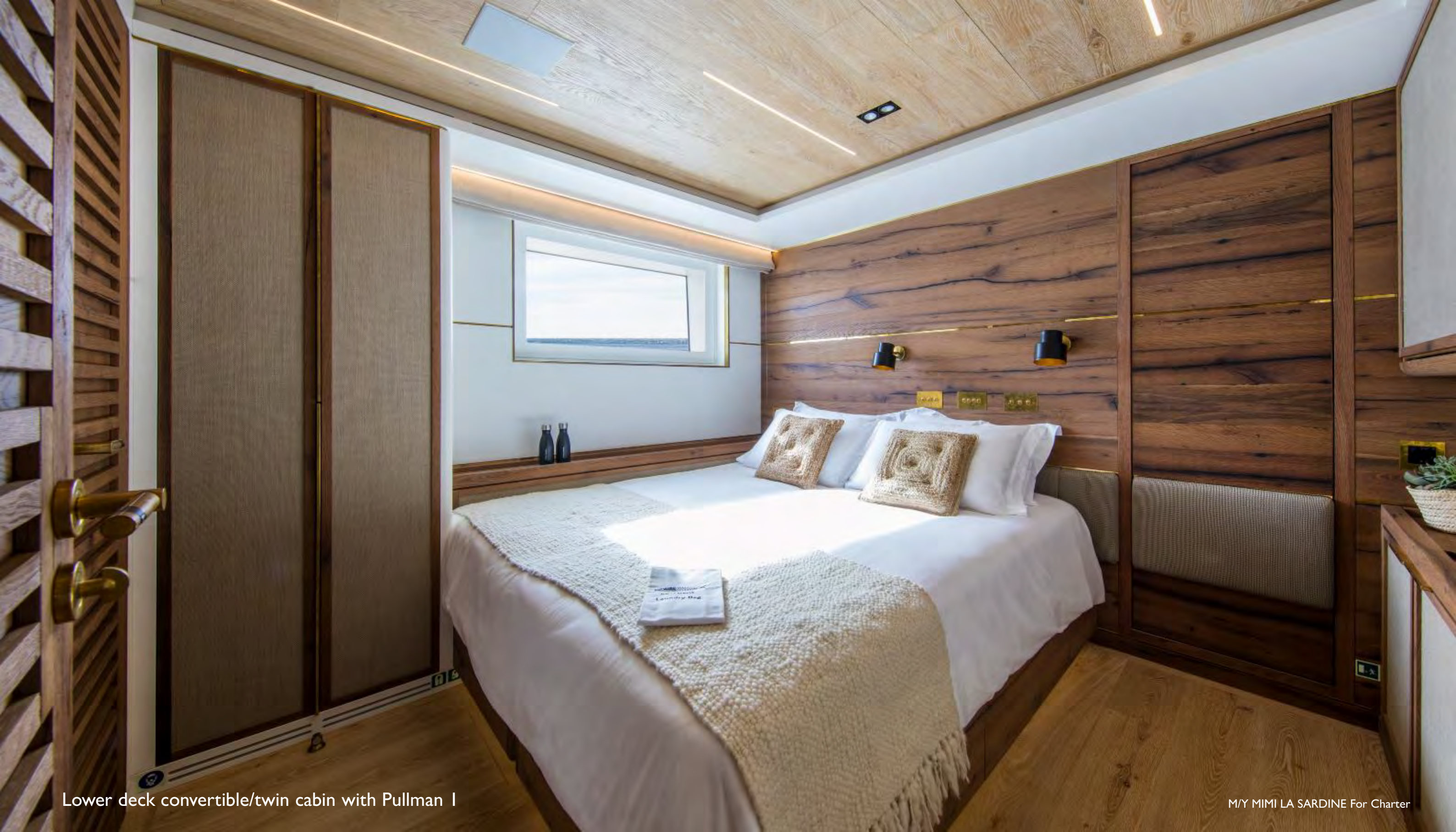
Lower deck convertible/twin cabin with Pullman I