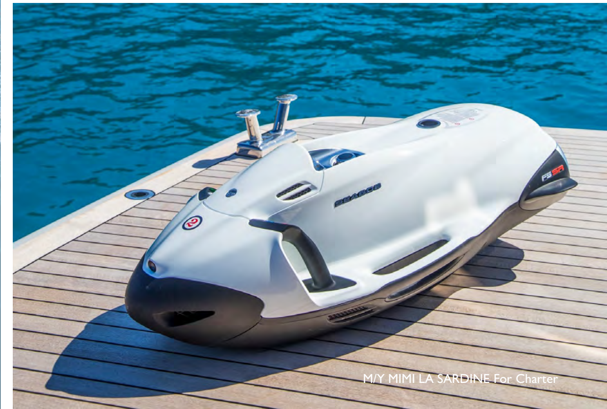
M/Y MIMI LA SARDINE For Charter