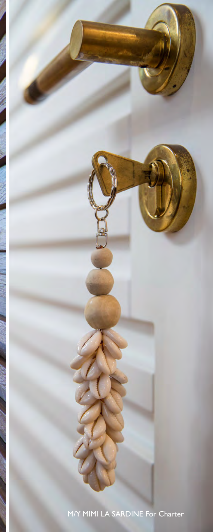
M/Y MIMI LA SARDINE For Charter