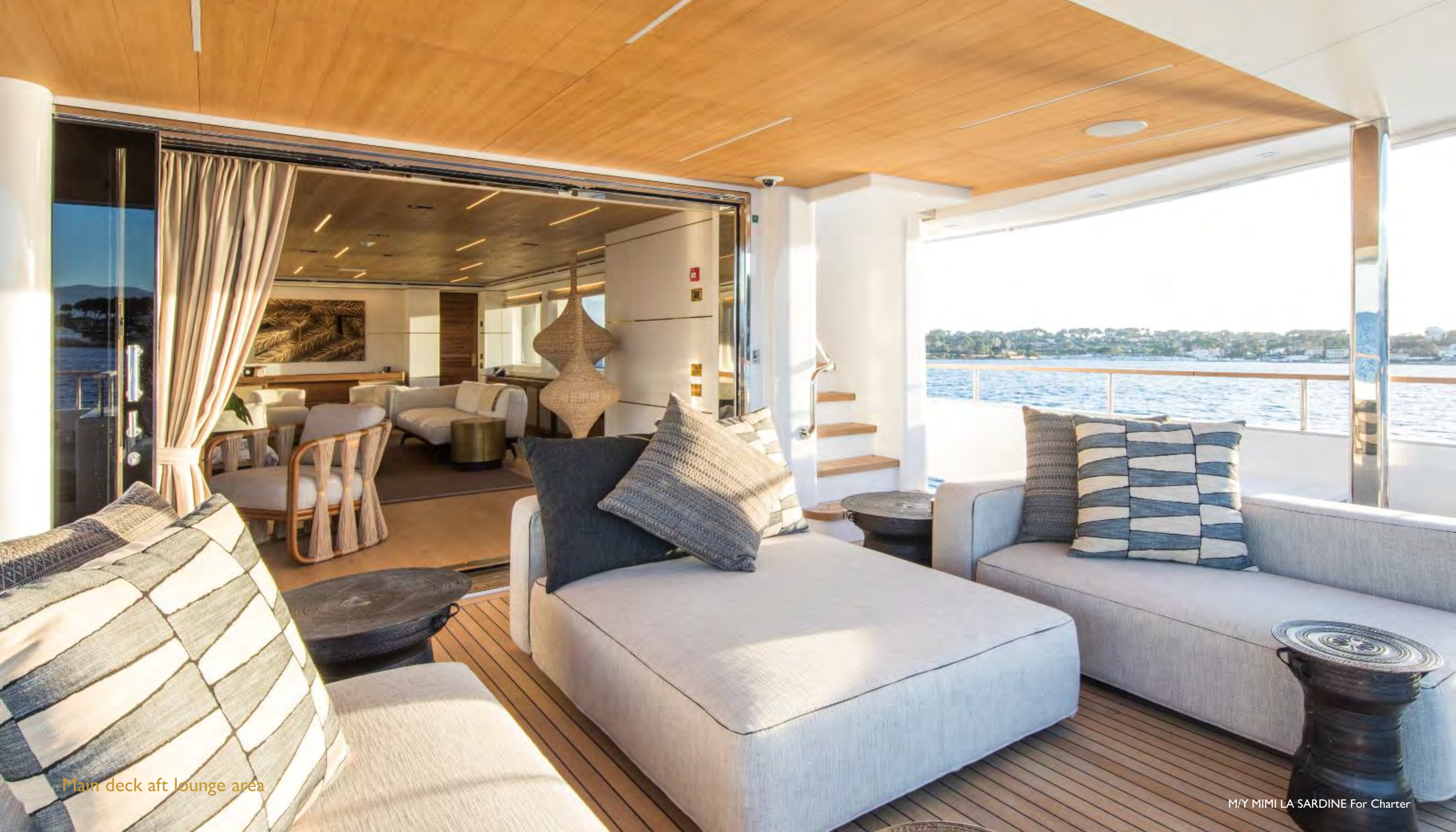
Main deck aft lounge area