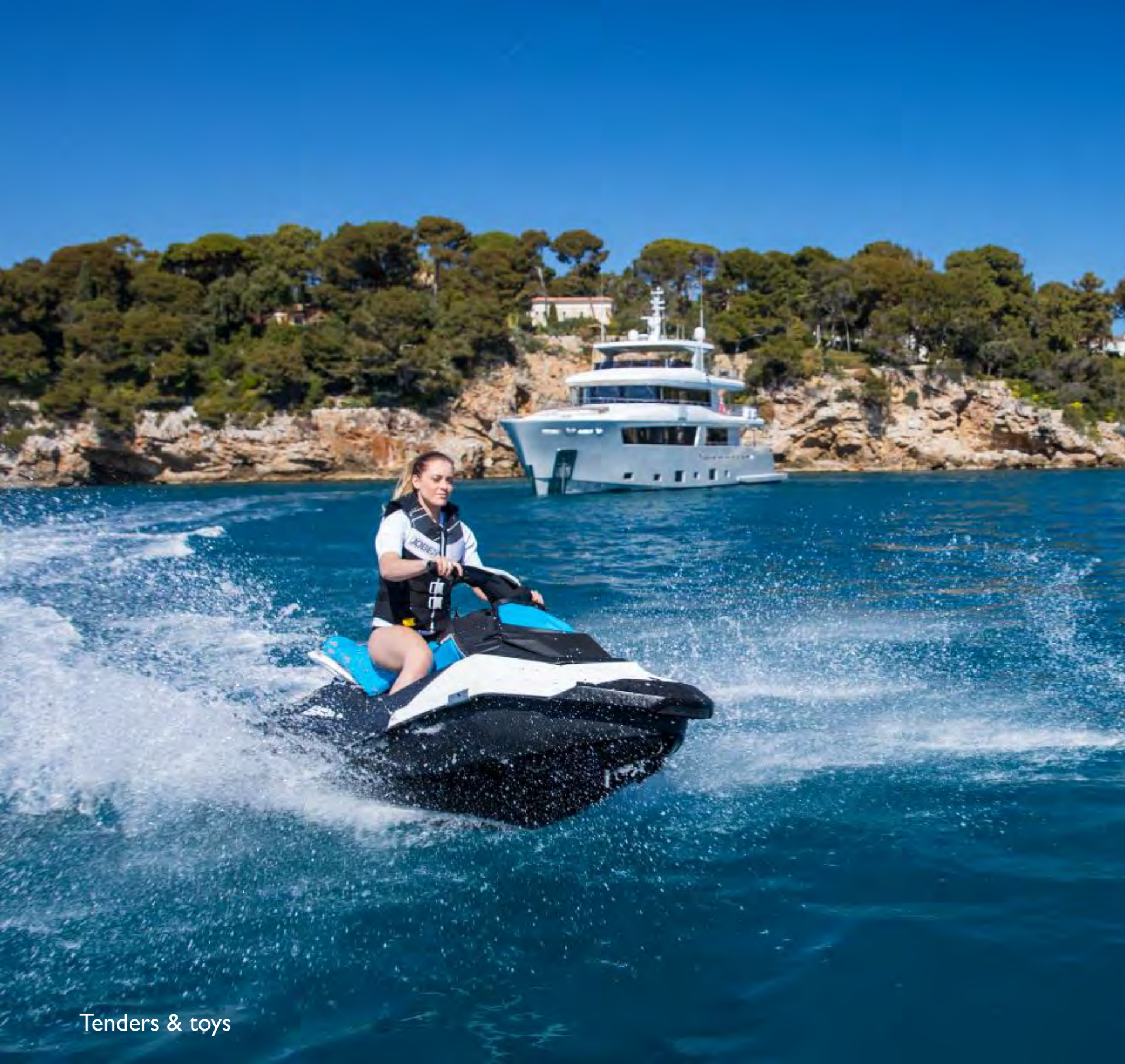
Tenders & toys