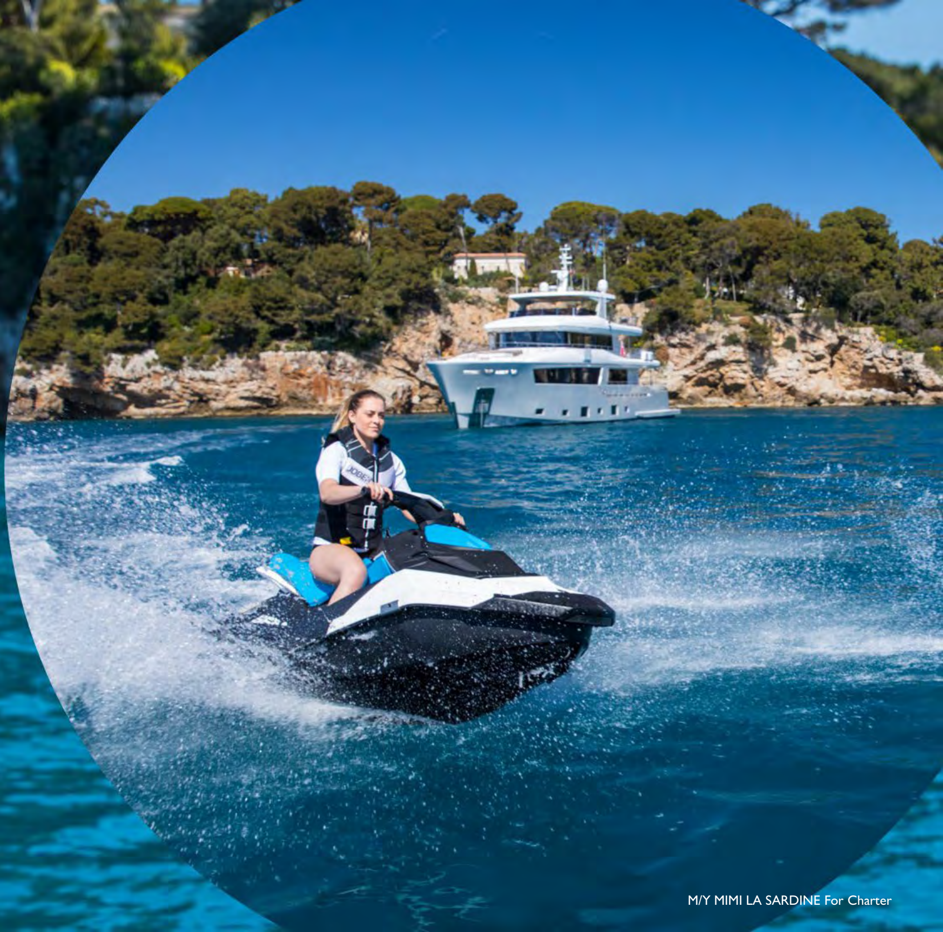
M/Y MIMI LA SARDINE For Charter