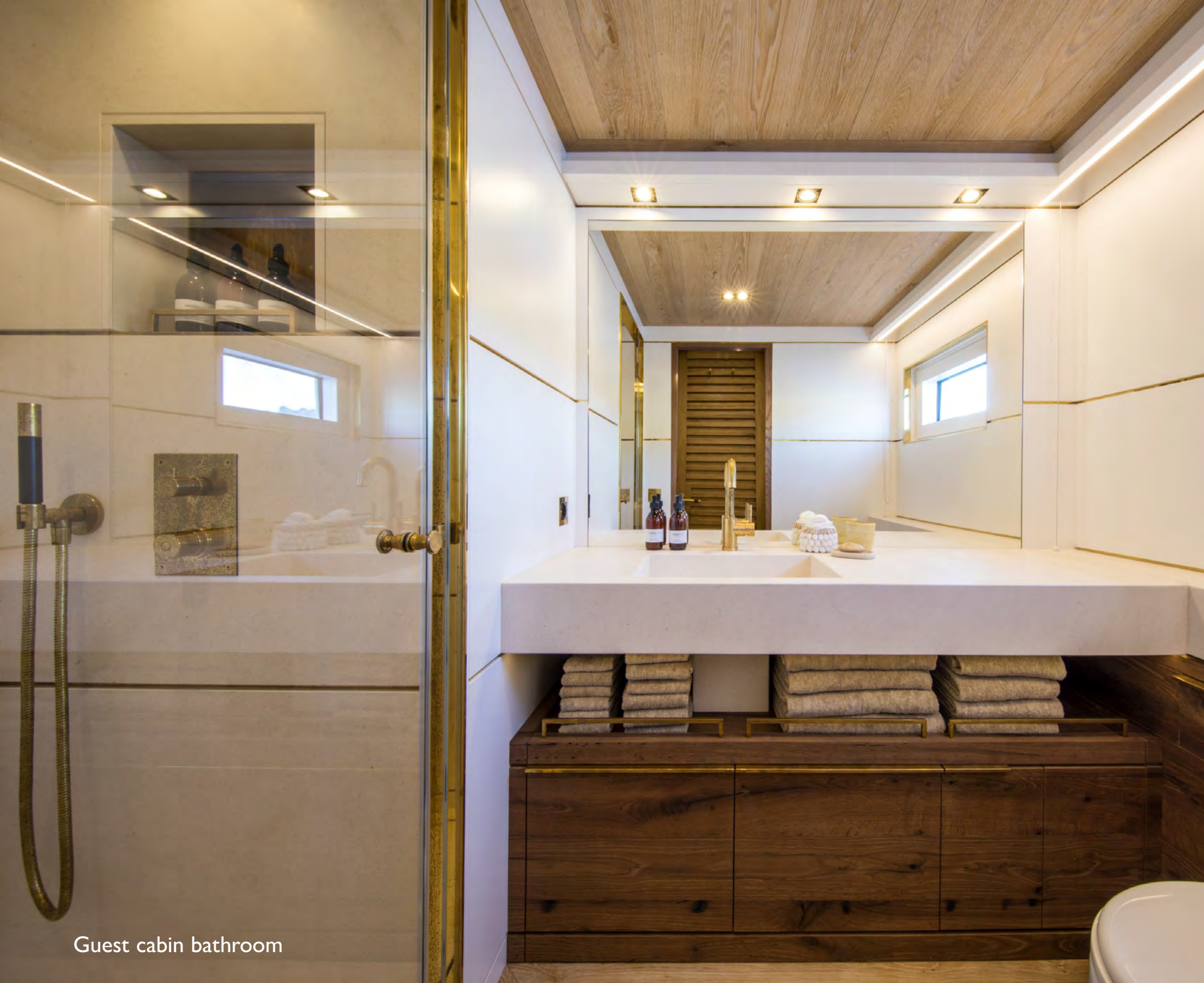
Guest cabin bathroom