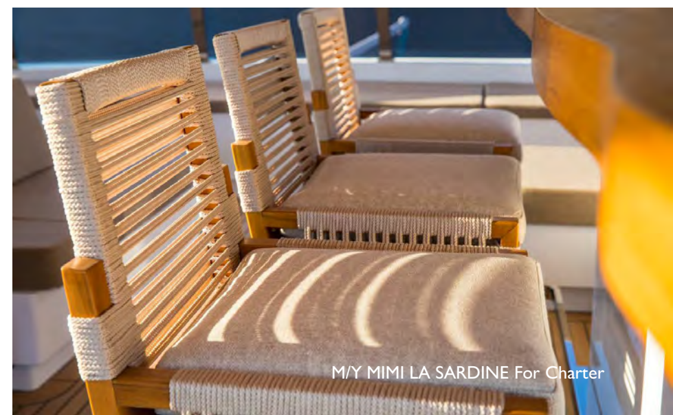
M/Y MIMI LA SARDINE For Charter