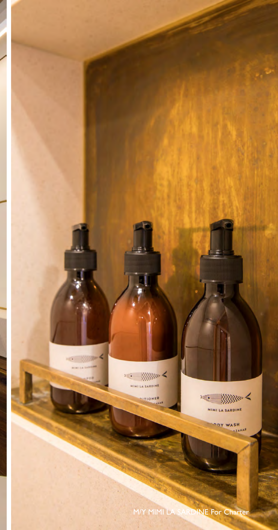
M/Y MIMI LA SARDINE For Charter