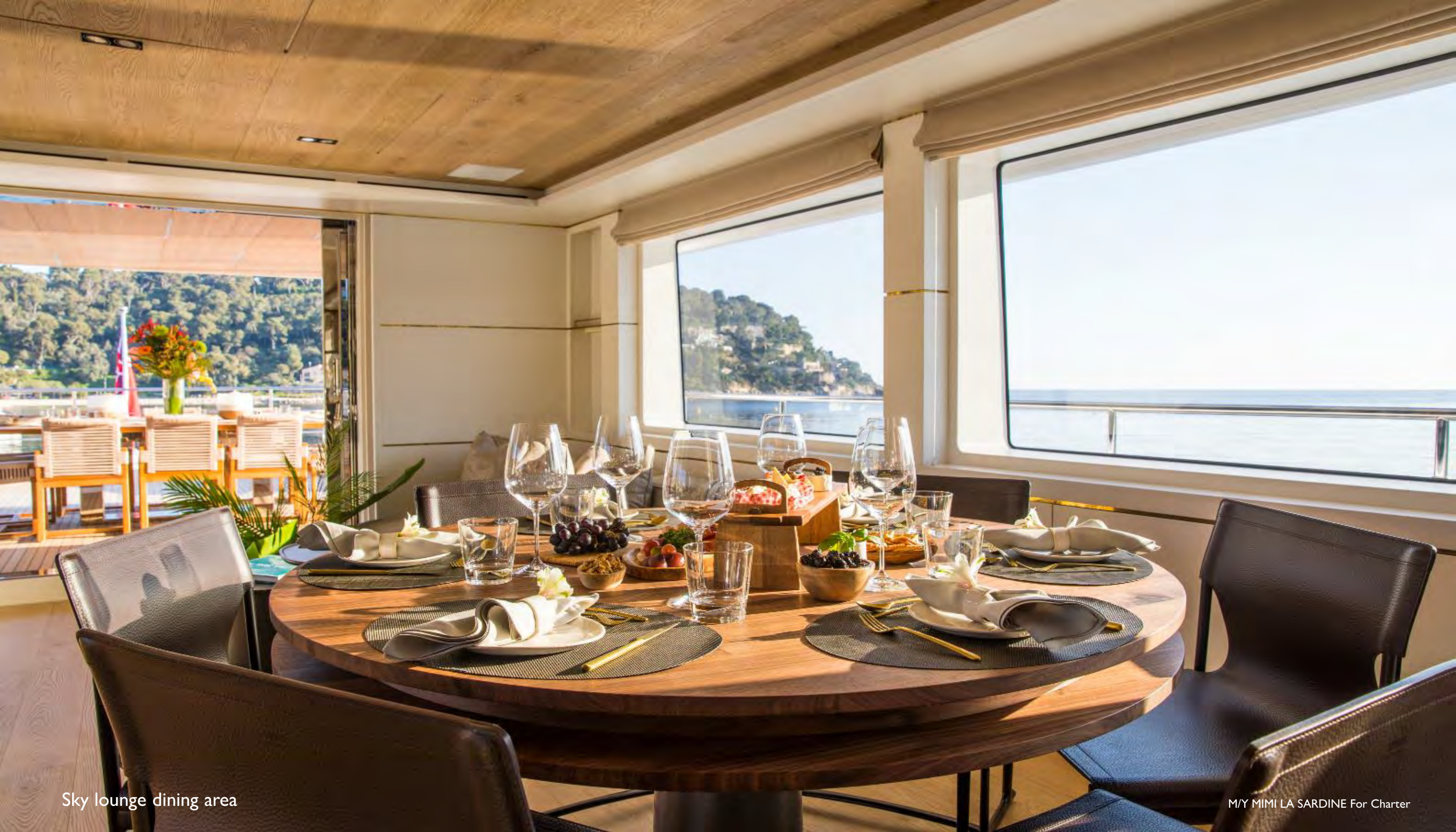
Sky lounge dining area