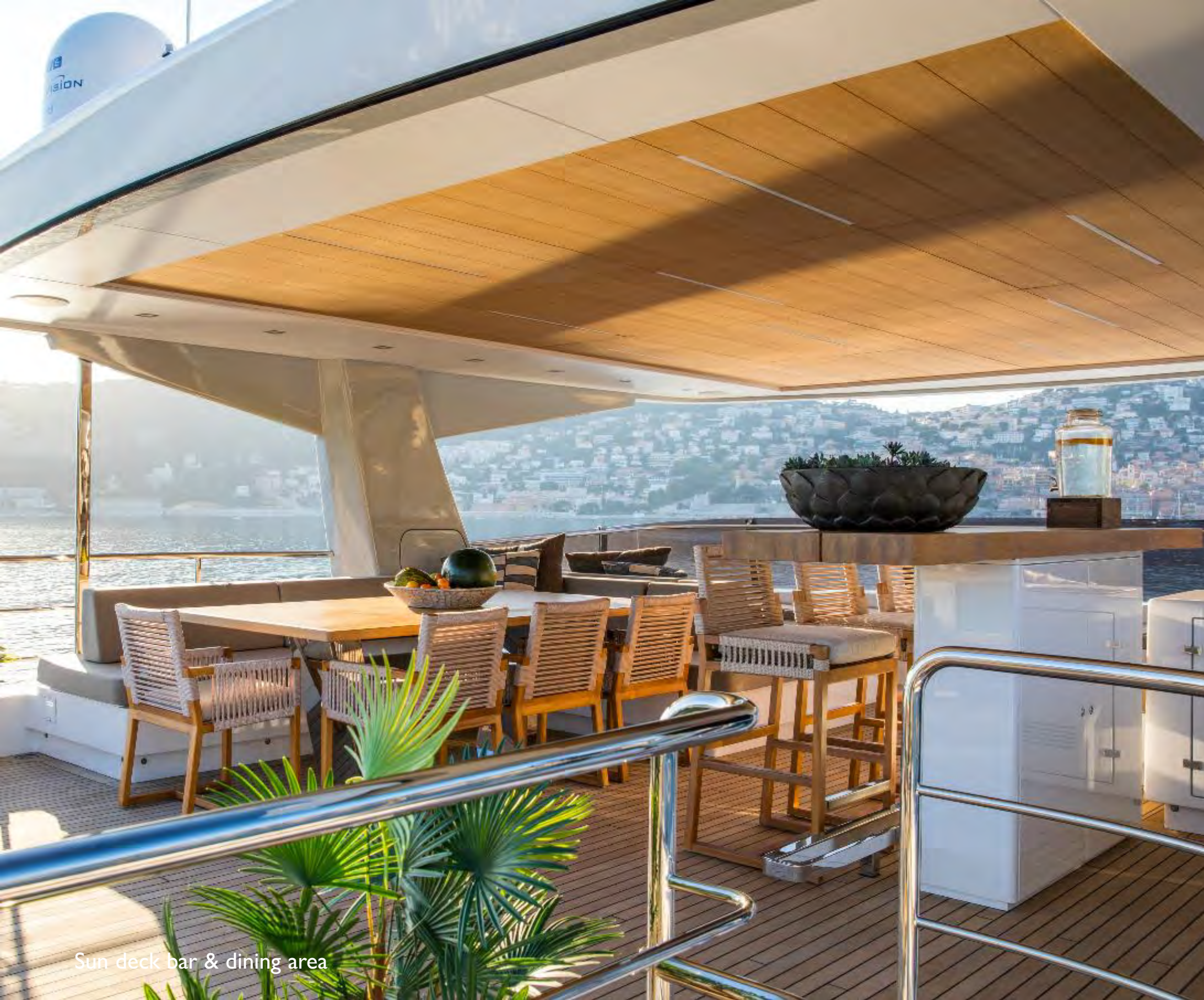
Sun deck bar & dining area