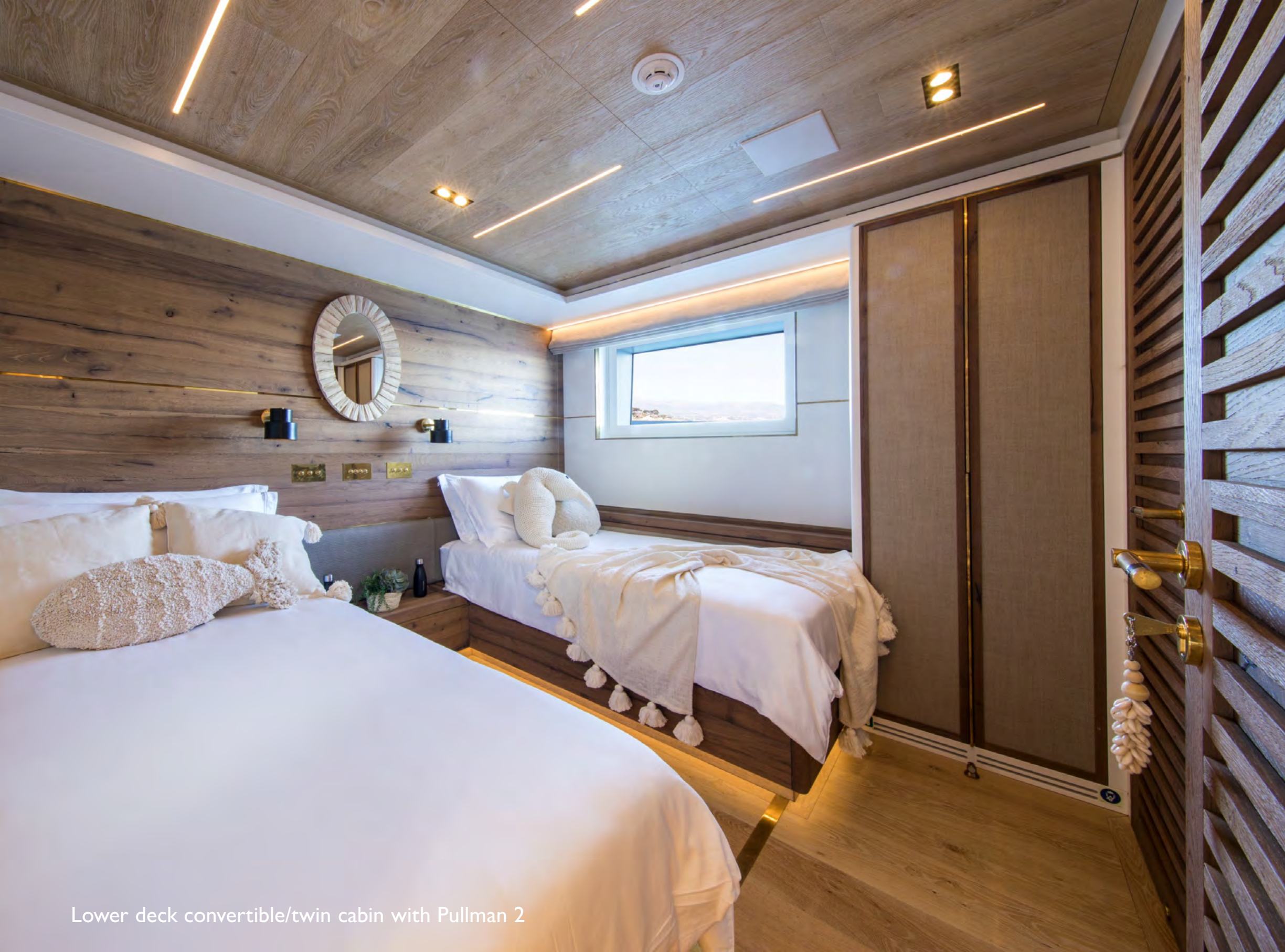
Lower deck convertible/twin cabin with Pullman 2