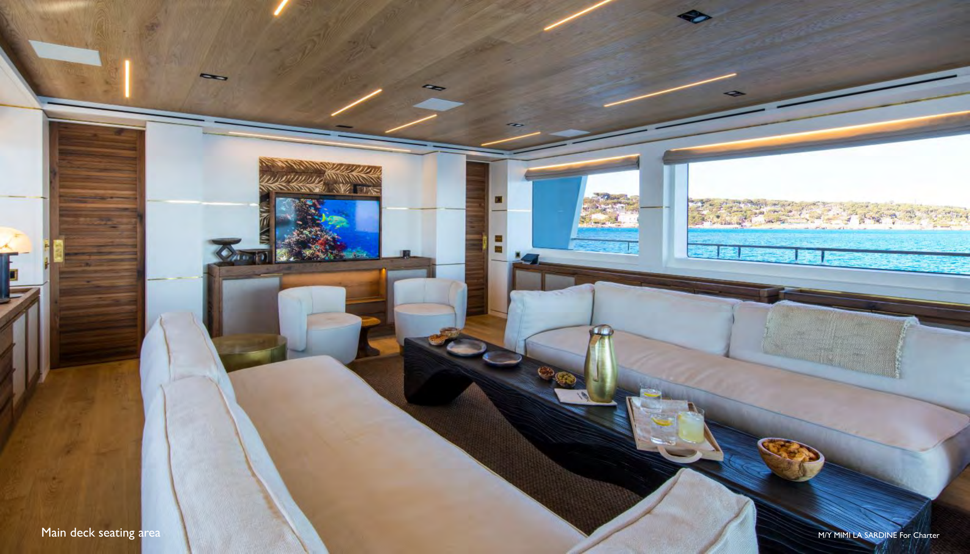
Main deck seating area