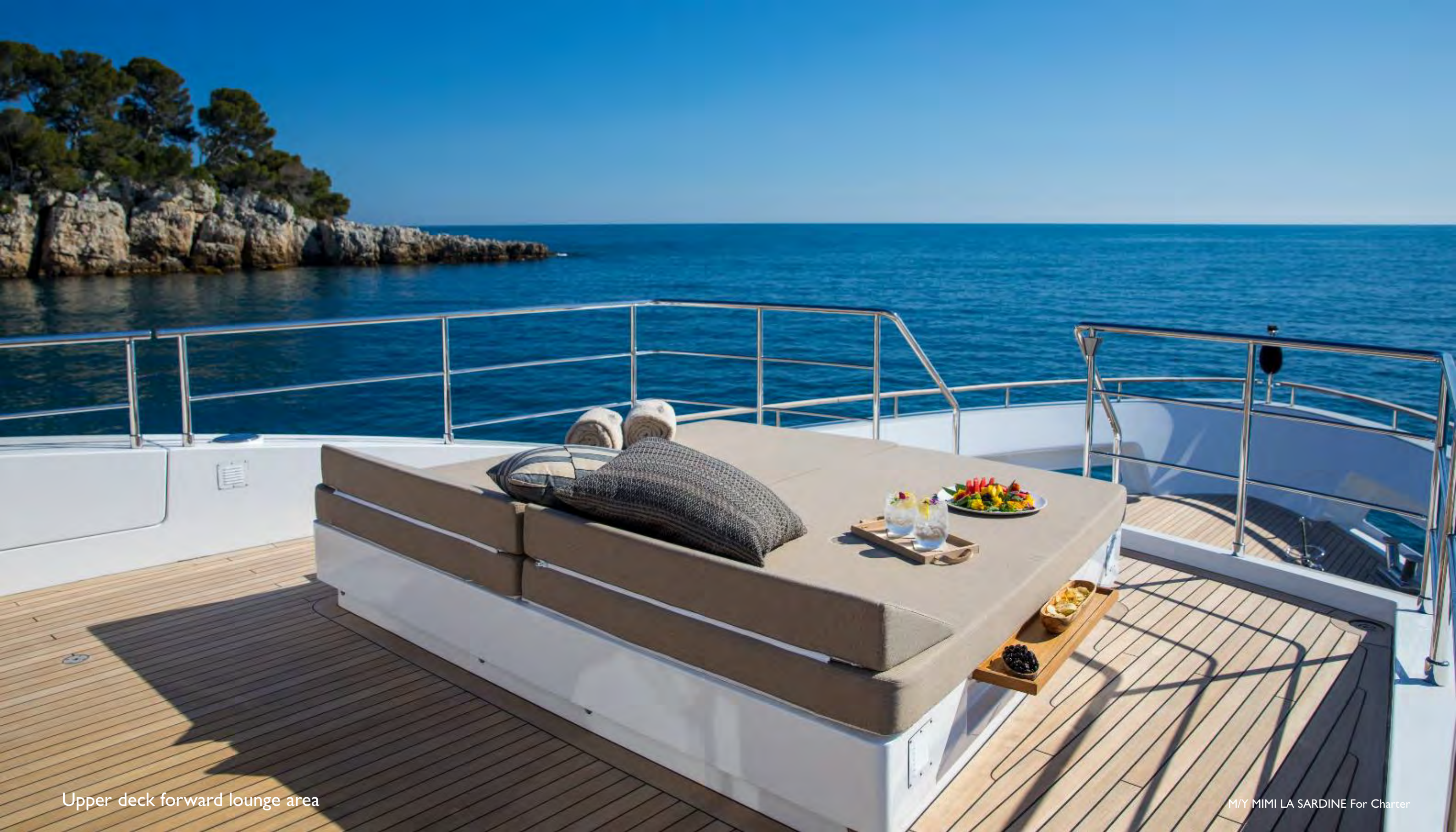
Upper deck forward lounge area