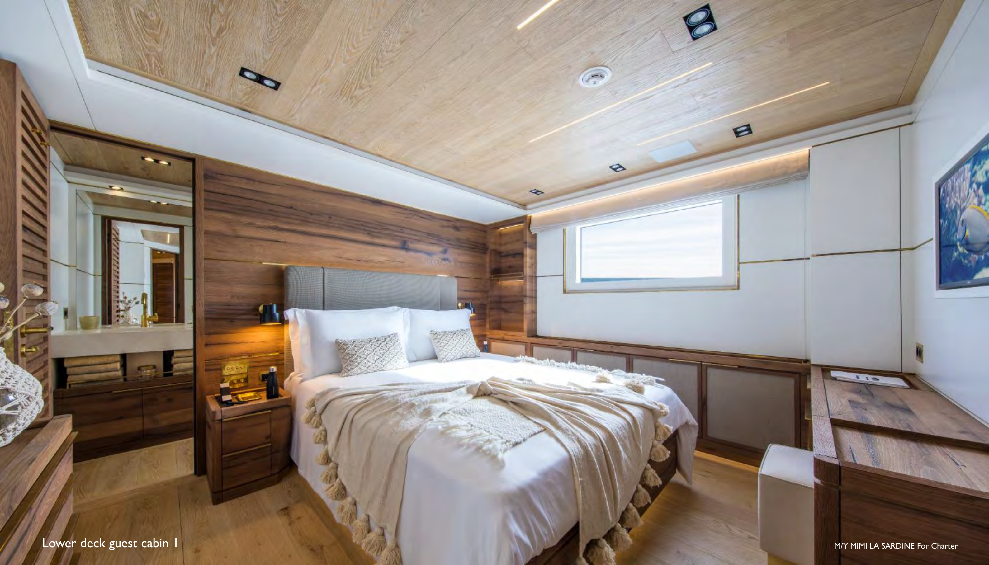
Lower deck guest cabin I