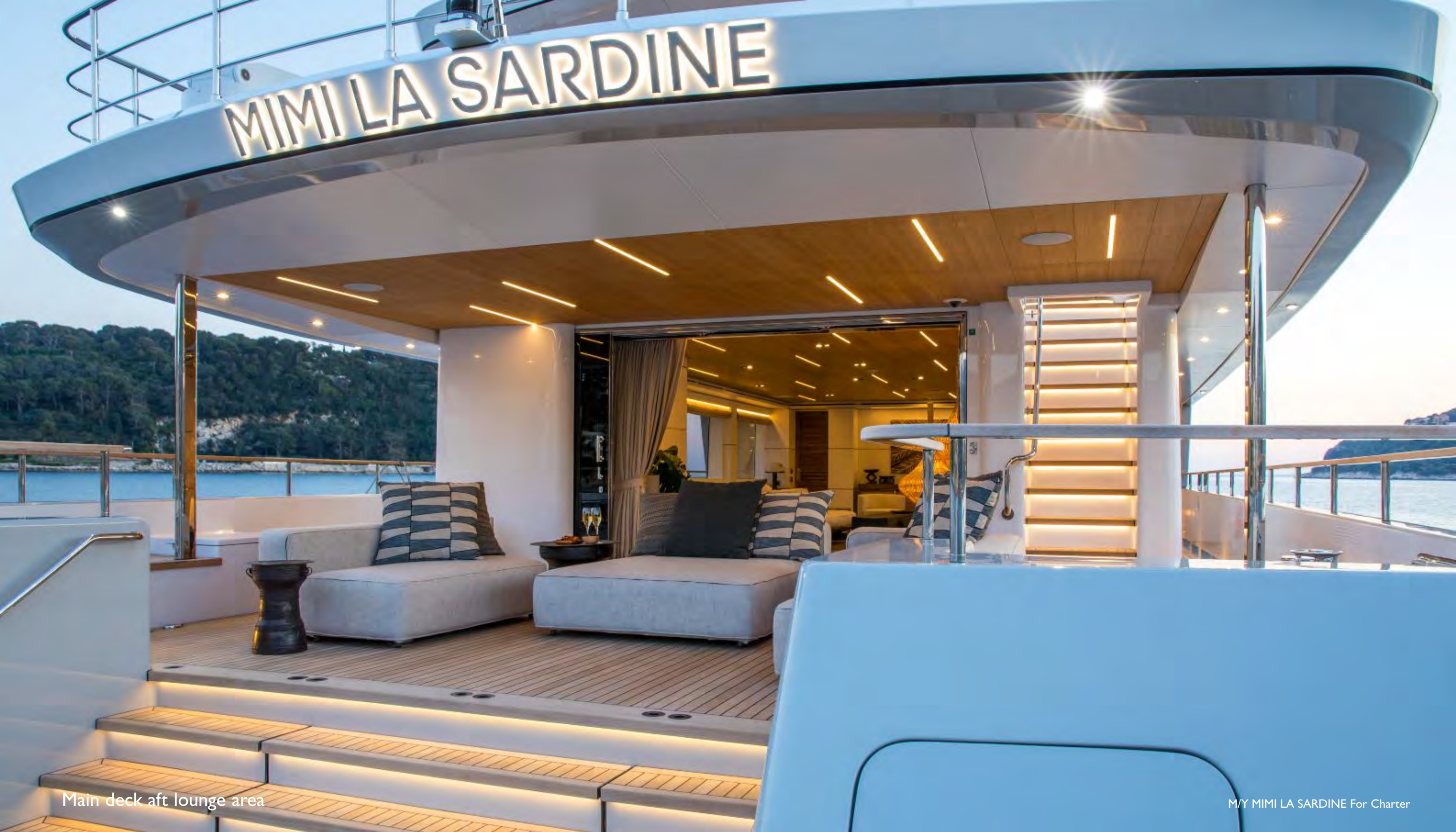
Main deck aft lounge area