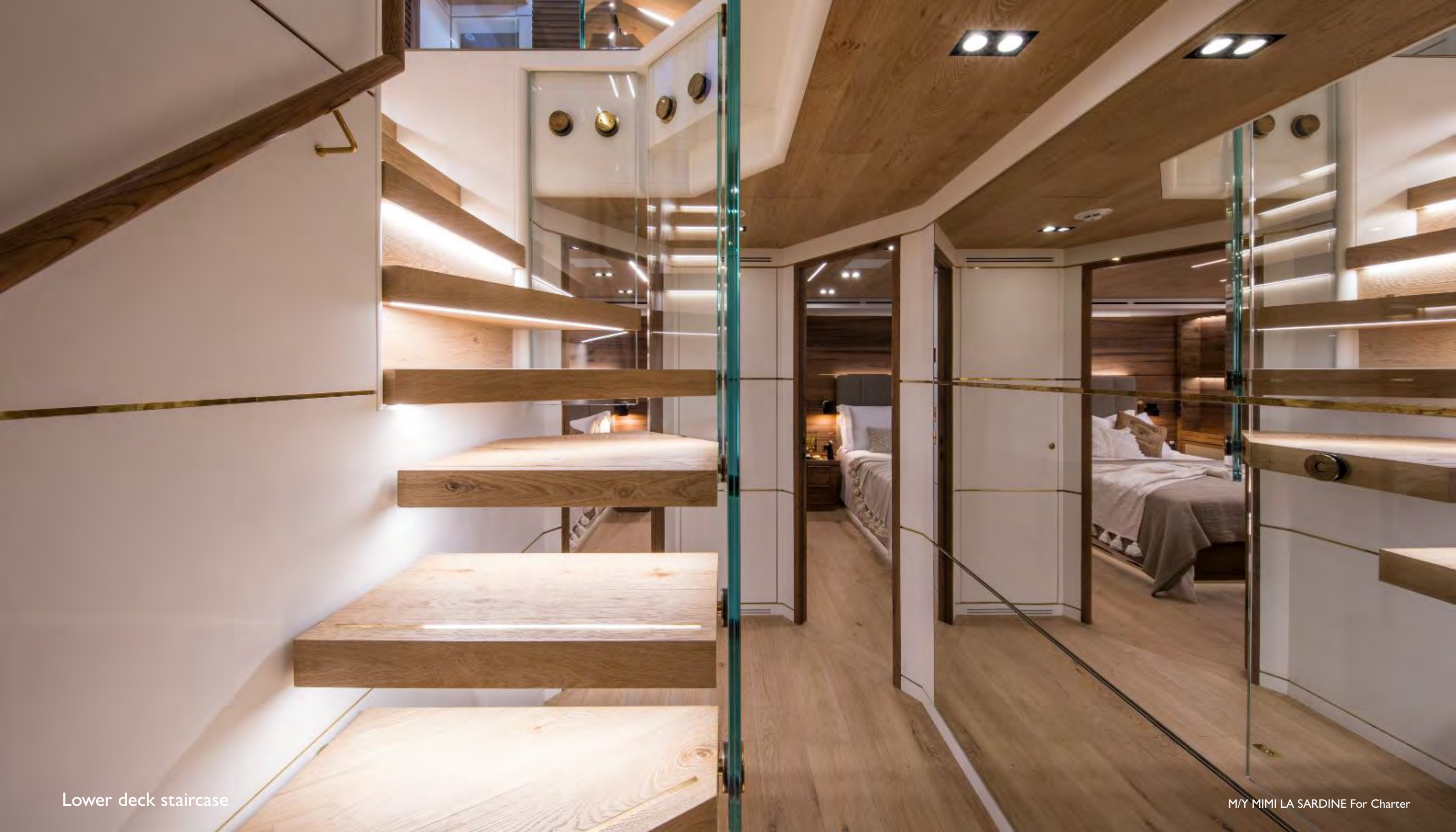
Lower deck staircase