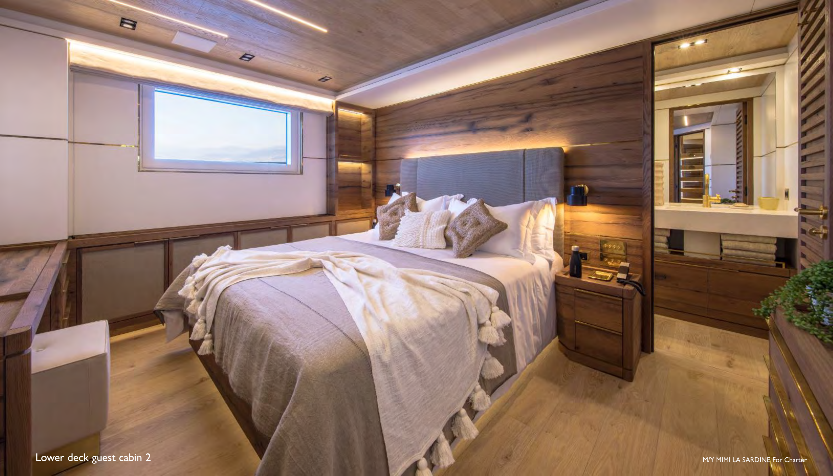
Lower deck guest cabin 2