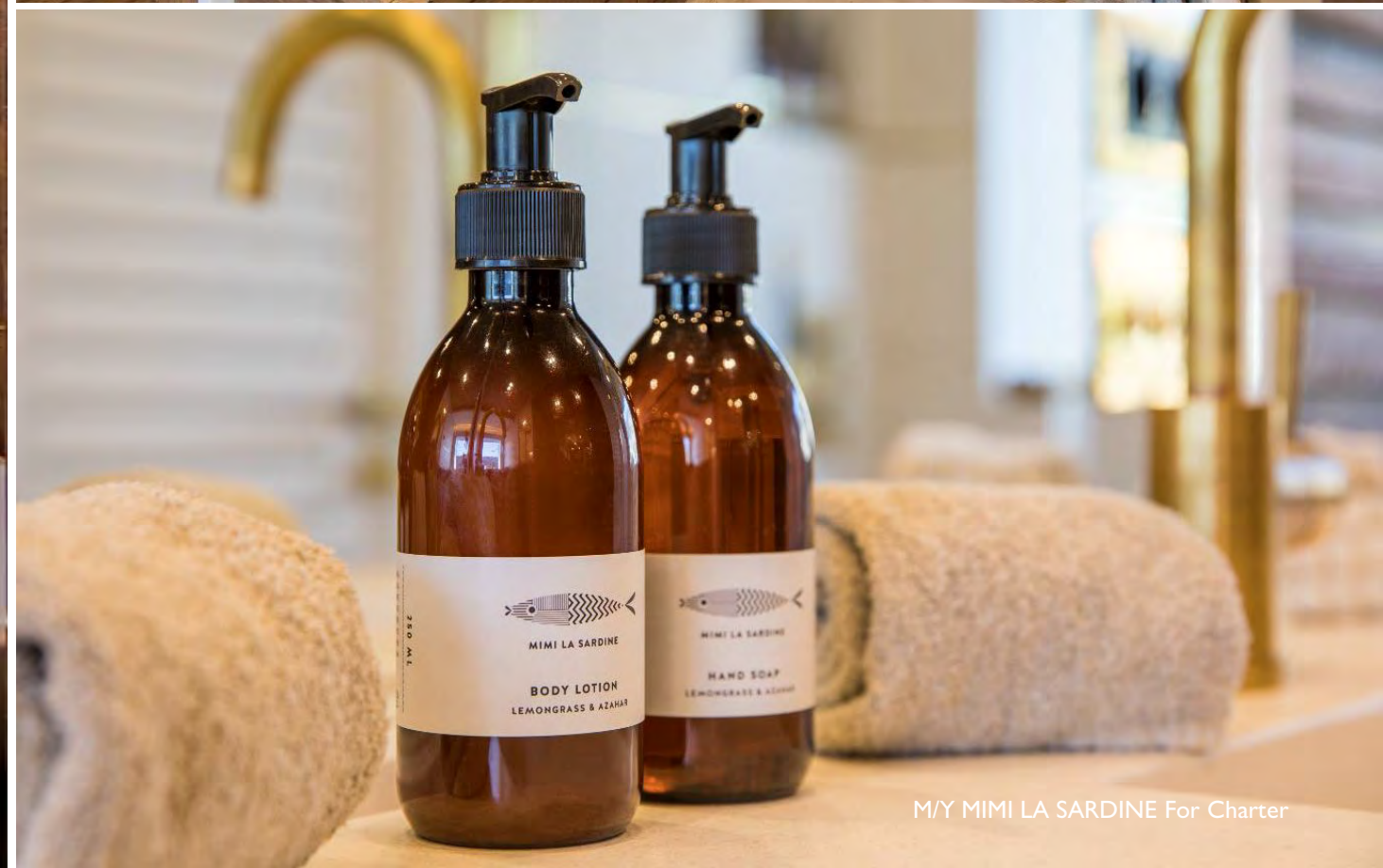
M/Y MIMI LA SARDINE For Charter