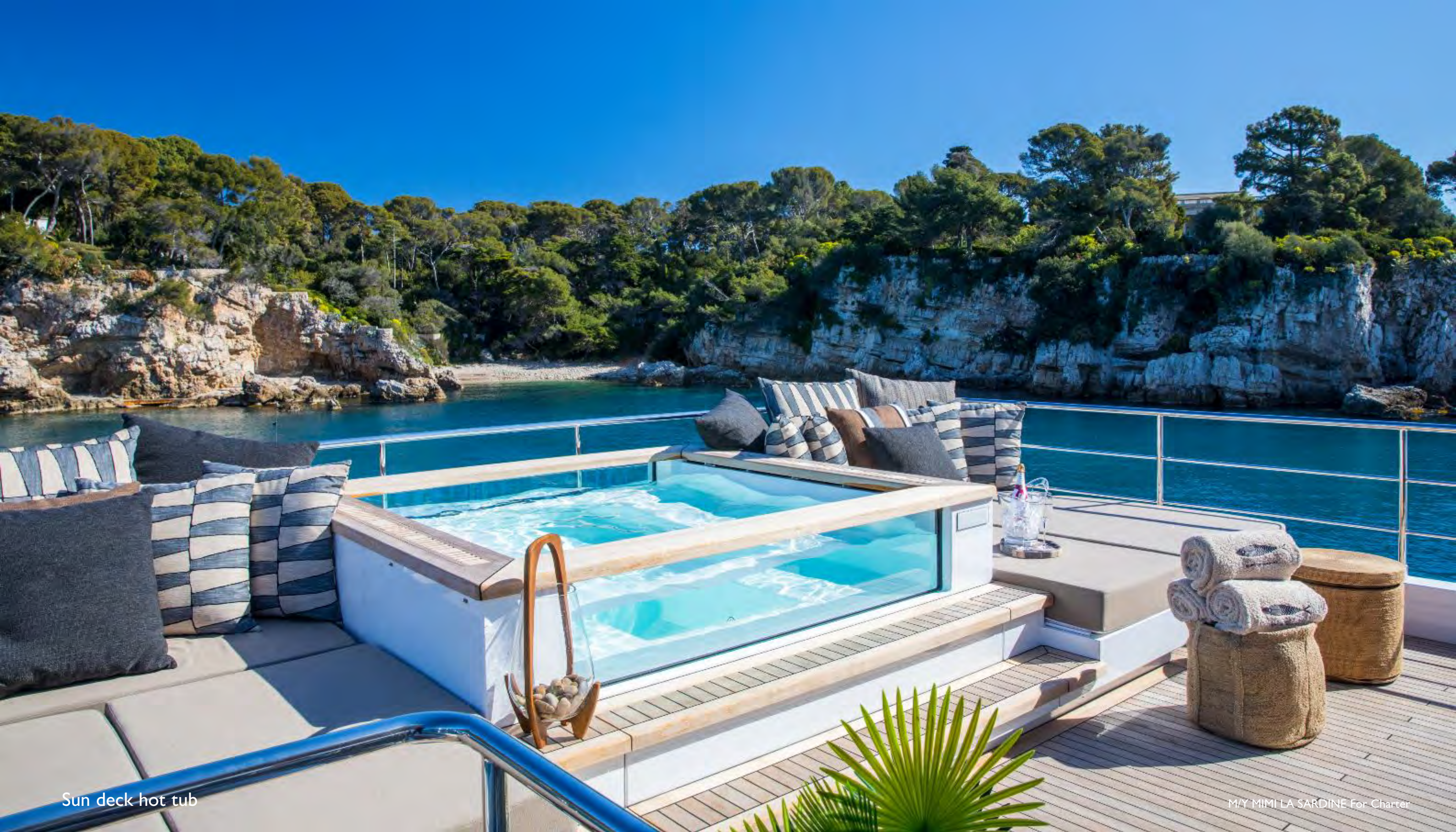
Sun deck hot tub